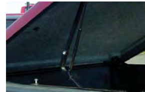
Super Lift System