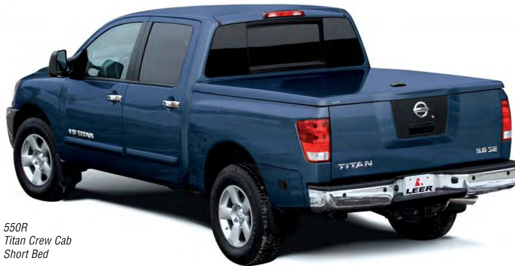
550R Titan Crew Cab Short Bed