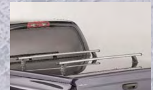
Thule® Aero Bar Roof Rack