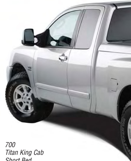
700 Titan King Cab Short Bed