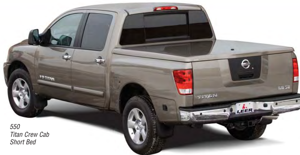
550 Titan Crew Cab Short Bed