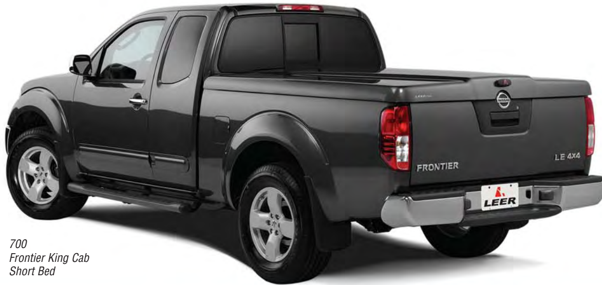
700 Frontier King Cab Short Bed