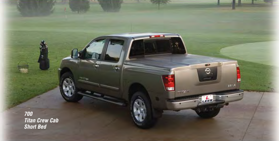
700 Titan Crew Cab Short Bed