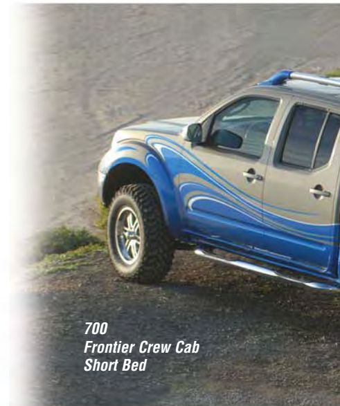
700 Frontier Crew Cab Short Bed