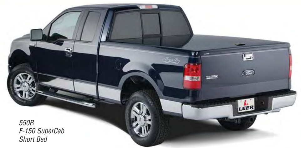
550R F-150 SuperCab Short Bed

550R This value priced, low-profile design features a black anodized LEER flip handle lock, heavy-gauge steel locking rods, 4-bar articulating hinge, and LEER pull strap. (Available in East and Midwest regions only.)