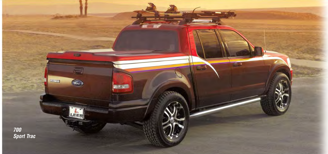
700 Sport Trac