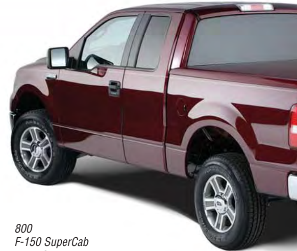
800 F-150 SuperCab Extra Short Bed