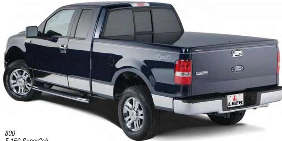
800 F-150 SuperCab Short Bed