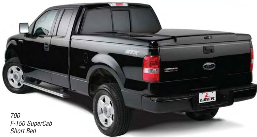
700 F-150 SuperCab Short Bed