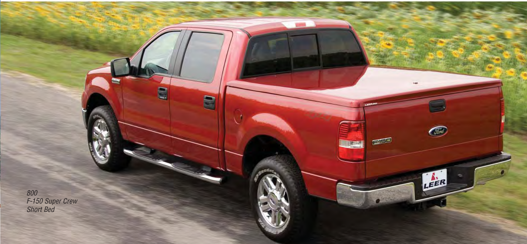
800 F-150 Super Crew Short Bed