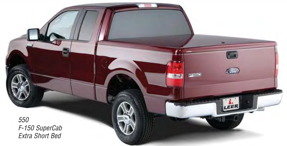
550 F-150 SuperCab Extra Short Bed

550 This aerodynamic, low-profile design features a LEER super lift system, center mounted lock and automotive style rotary latches. (Available in Western region only.)