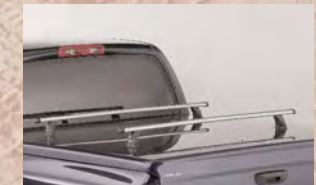
Thule® Aero Bar Gear Rack