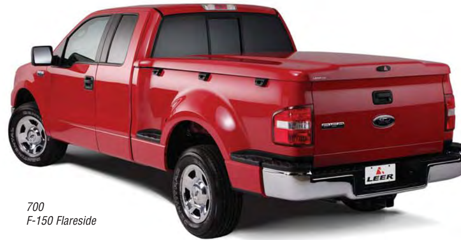
700 F-150 Flareside