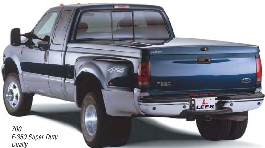
700 F-350 Super Duty Dually

550R This value priced, low-profile design features a black anodized LEER flip handle lock, heavy-gauge steel locking rods, 4-bar articulating hinge, and LEER pull strap. (Available in East and Midwest regions only.)